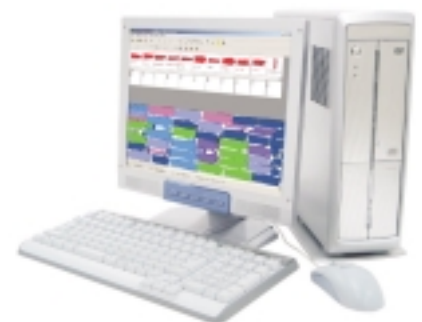
Gemini Nesting Station - one station can perform up to 200 markers/day

Gemini Nest Expert can output the nesting results in its own file format *.pt or *.mrk, but can also export in all major industry standards: DFX-AAMA, HPGL-PLT, ISO-CUT and RS274D. After automatic nesting, the markers can be directly plotted or send to automatic cutting machine.